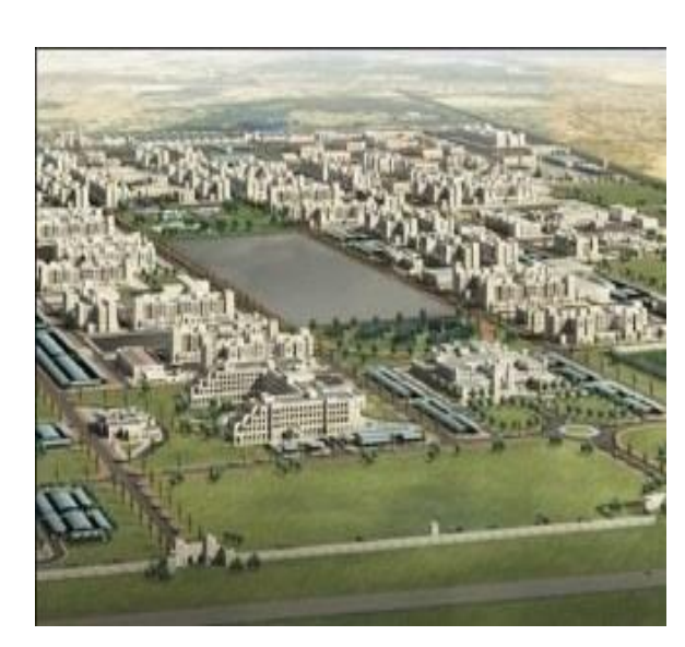
ISF New Camp at Duhail