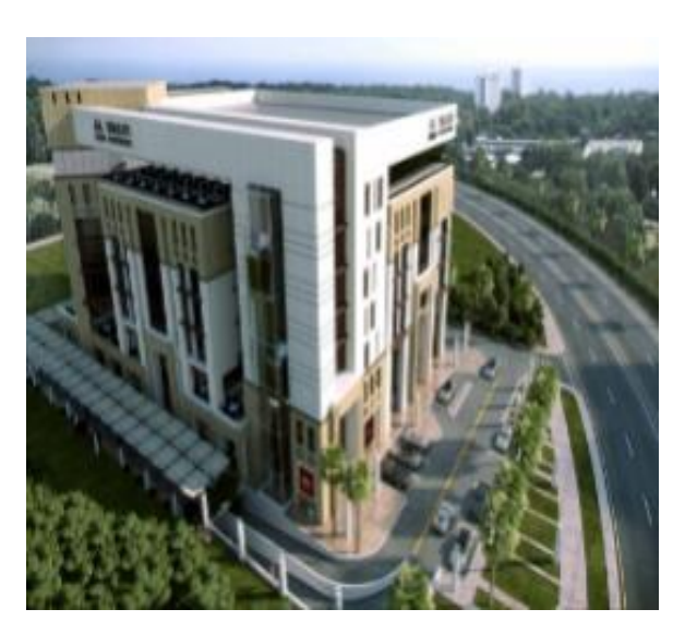
Al Naqi Center Lusail