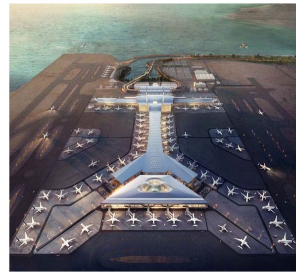
HIA Expansion Project