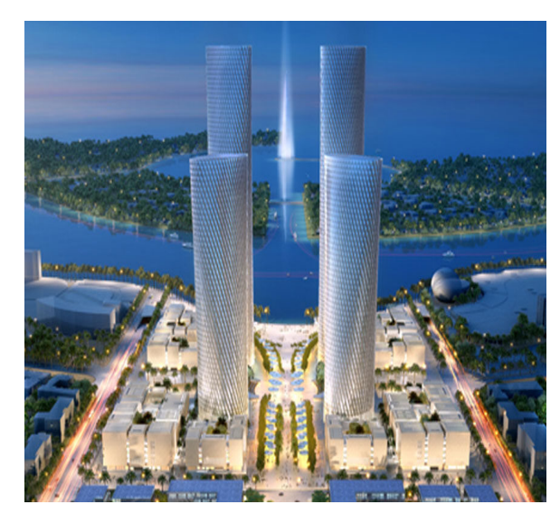
Lusail Plaza Towers