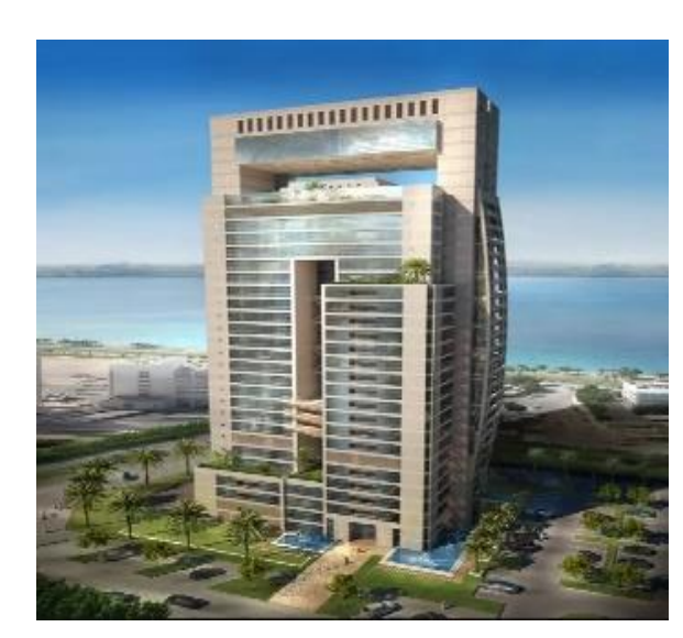
Al Darwish Tower