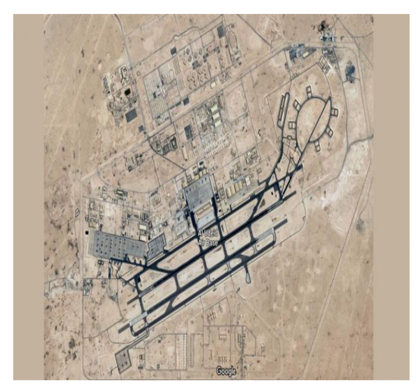
AUAB -Accomodation & Support Facilities